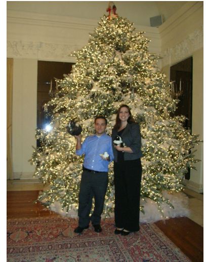
Natalie & I after our show at the British Embassy

For more info about any of our shows please feel free to call us toll free at 1 877 987 4201 anytime.